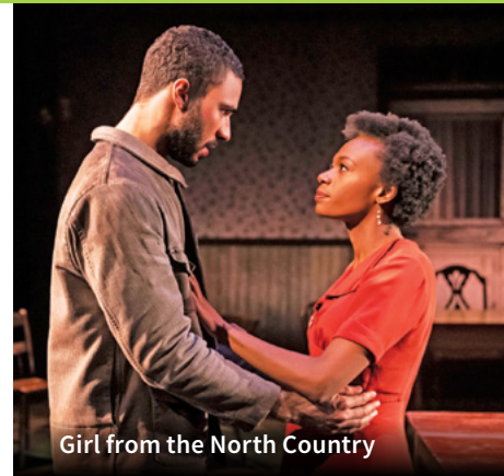
Girl from the North Country