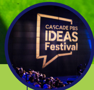
Cascade PBS Ideas Festival