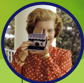
American Experience: Mr. Polaroid