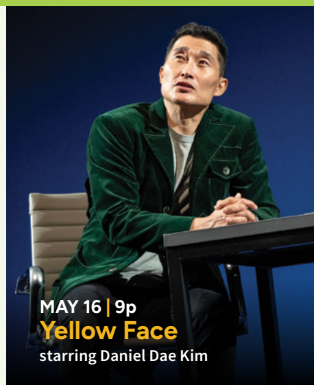
MAY 16 | 9p Yellow Face starring Daniel Dae Kim