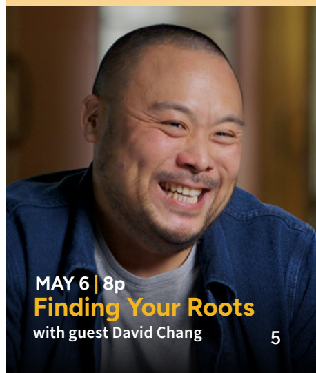
MAY 6 | 8p Finding Your Roots with guest David Chang