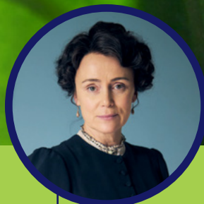
Miss Austen on Masterpiece