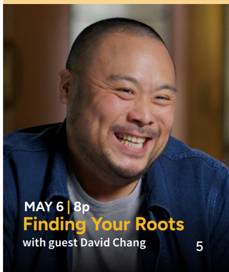
MAY 6 | 8p Finding Your Roots with guest David Chang