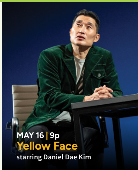
MAY 16 | 9p Yellow Face starring Daniel Dae Kim