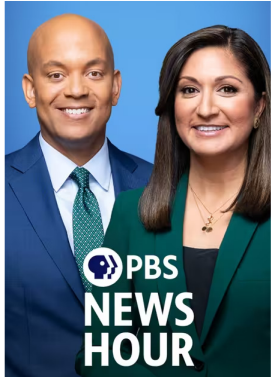
PBS NEWS HOUR