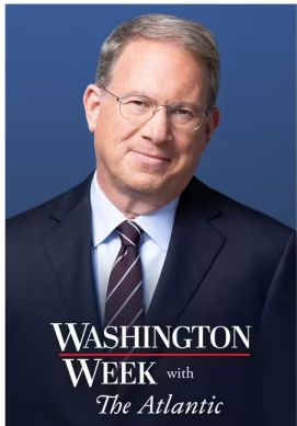
WASHINGTON WEEK with The Atlantic