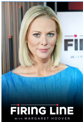
FIRING LINE WITH MARGARET HOOVER