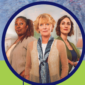
The Marlow Murder Club on Masterpiece