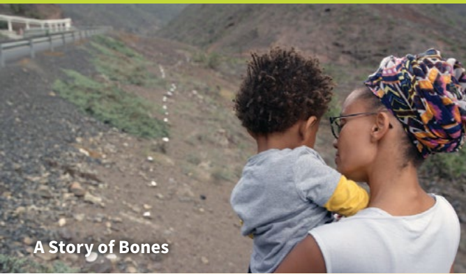
A Story of Bones