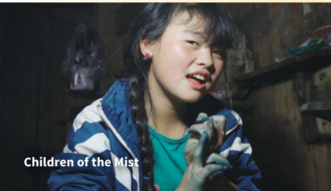
Children of the Mist