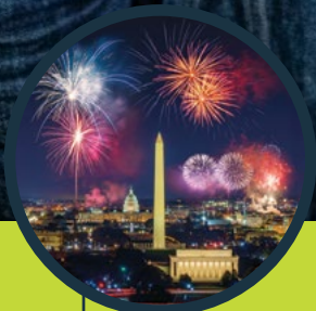
A Capitol Fourth