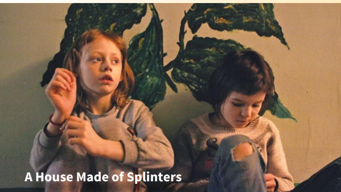
A House Made of Splinters