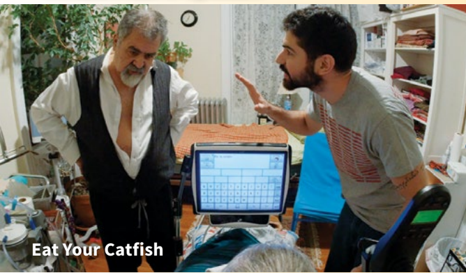
Eat Your Catfish