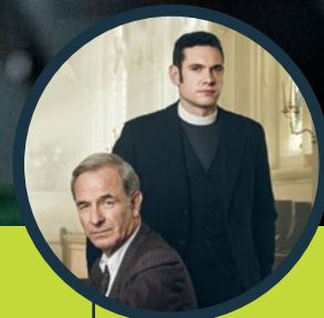
Grantchester on Masterpiece