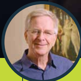
Rick Steves' Art of Europe