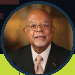
Making Black America: Through the Grapevine