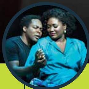
Great Performances at the Met: Fire Shut Up in My Bones