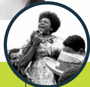
Fannie Lou Hamer's America: An America Reframed Special