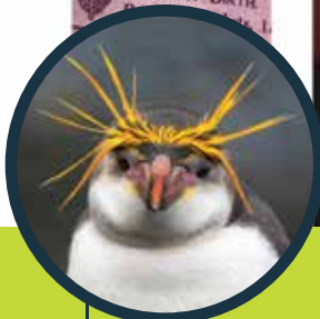
Nature: Penguins – Meet the Family