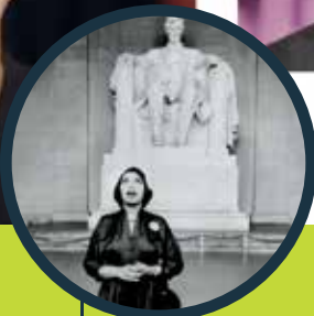
American Masters: Marian Anderson