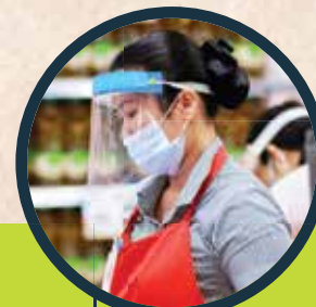
Frontline: The Virus that Shook the World