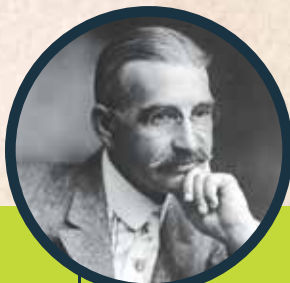
American Experience: American Oz