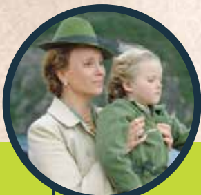
Atlantic Crossing on Masterpiece