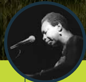
American Masters: How It Feels to Be Free