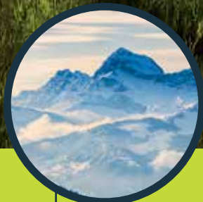
Nature: The Alps