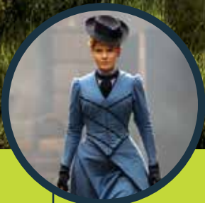
Masterpiece: Miss Scarlet & The Duke