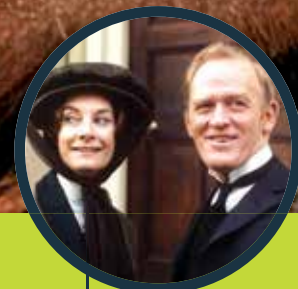
Masterpiece 50 Fabulous Years