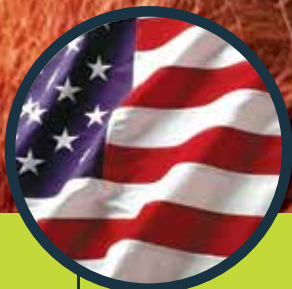
PBS NewsHour Election Night Coverage