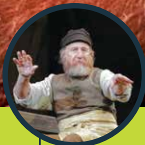
Great Performances Fiddler: A Miracle of Miracles