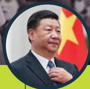
China: Power and Prosperity