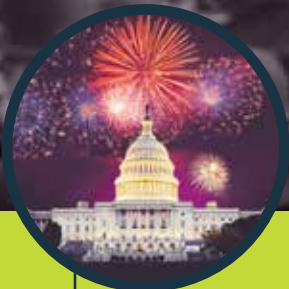
A Capitol Fourth 2020