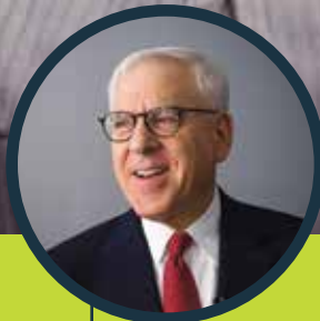
History with David Rubenstein