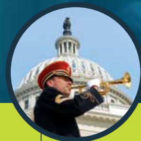
National Memorial Day Concert 2020