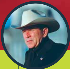
George W. Bush: American Experience