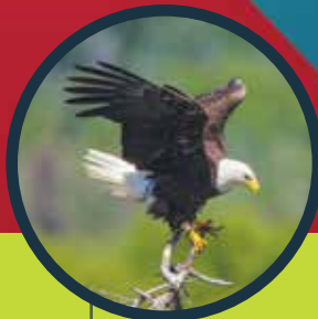
NOVA: Eagle Power