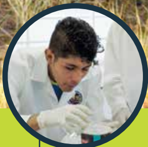
POV: Inventing Tomorrow