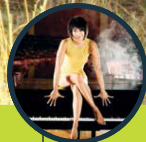
Vienna Philharmonic Summer Night Concert 2019