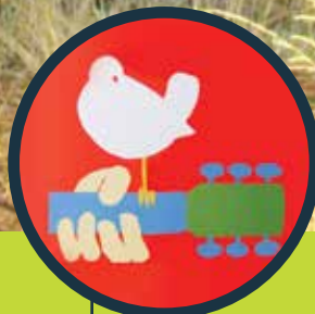
Woodstock: Three Days That Defined a Generation