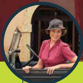
The Durrells in Corfu Season 4 on Masterpiece