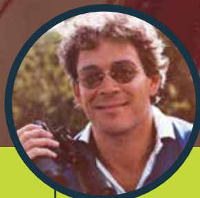
American Masters: Raúl Juliá