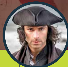
Poldark Season 5 on Masterpiece