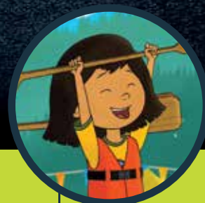
Molly of Denali