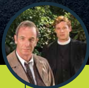
Grantchester Season 4 on Masterpiece