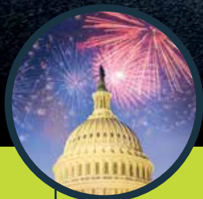
A Capitol Fourth