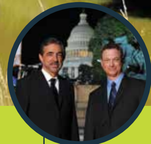
National Memorial Day Concert 2019