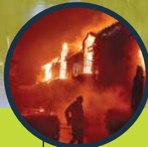
NOVA: Inside the Megafire