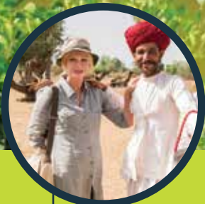
Joanna Lumley's India